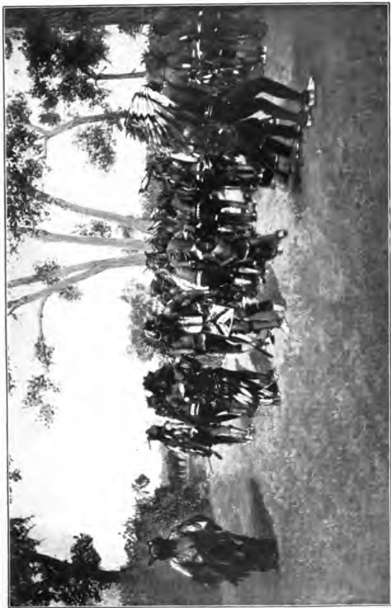
CROWS DANCING THE OMAHA OR GRASS DANCE